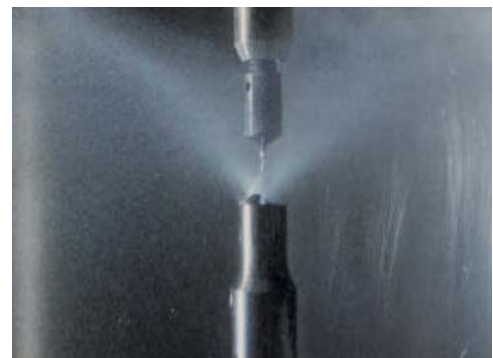
Ultrasonic Atomization of Low Melting Point Alloy and (top left) Gas Atomizer Close Coupled Nozzle

A unique course for practitioners and researchers on the principles & practice of powder manufacture by atomization of molten metals